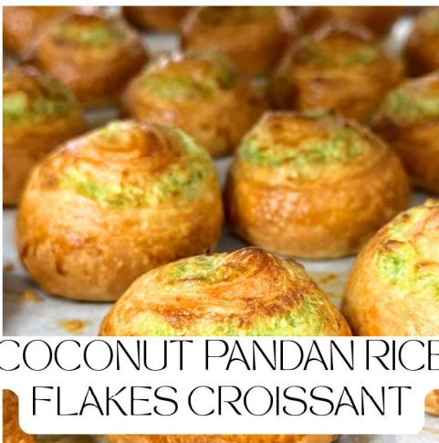
COCONUT PANDAN RICE FLAKES CROISSANT