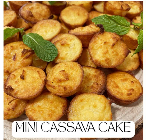
MINI CASSAVA CAKE