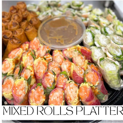
MIXED ROLLS PLATTER