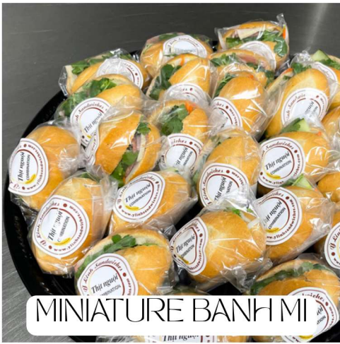
MINIATURE BANH MI