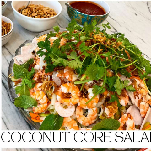
COCONUT CORE SALAD