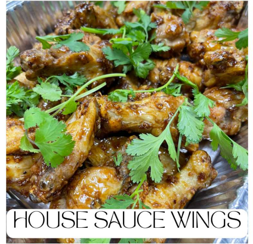
HOUSE SAUCE WINGS