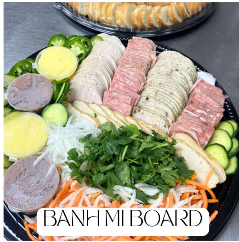
BANH MI BOARD