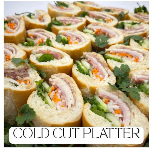
COLD CUT PLATTER